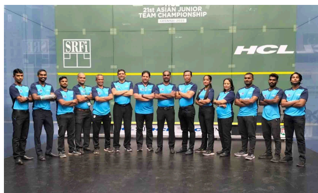
Referees Team at 21st Asian Junior Team Championships