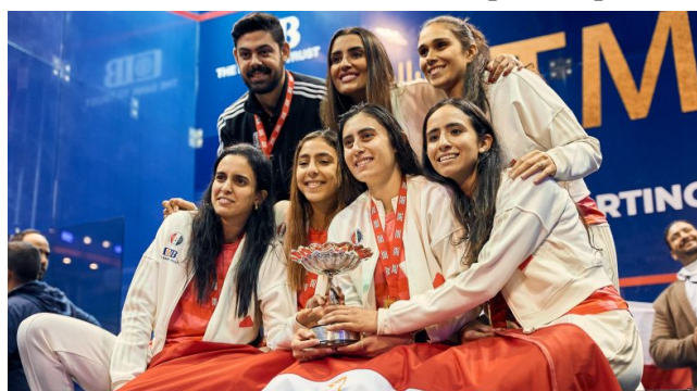
2022 WSF World Women's Team Champion - Egypt