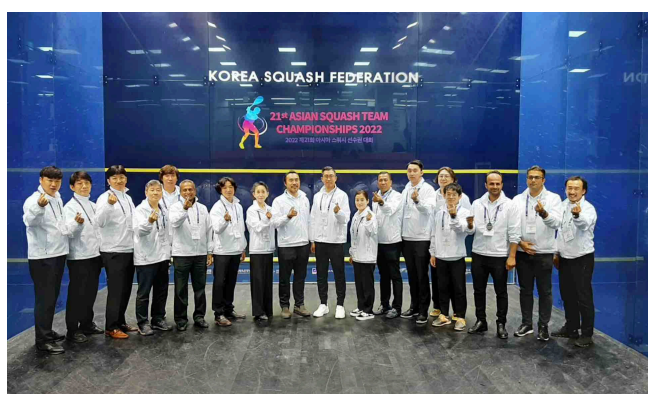
Referees Team at 21st Asian Team Championships

I would like to thank all the clinics/course instructors and assessors in Asia for their support during these trying times.