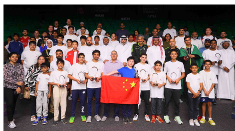
Qatar Junior Open