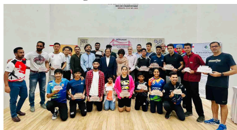
8th Bengal Eastern Slam

There were 8 junior competitions between October 2022 and April 2023. They are PBA 18th Penang (Malaysian) Junior Open, 8th Bengal Eastern Slam, CCI Western India Slam, REDtone 14th KL Junior Open, ONCOCARE Singapore Junior Open, Yazd Junior Open, HCL Indian Junior Open and Qatar Junior Open. We'd like to congratulate all participants and winners as well as to thank the organisers.