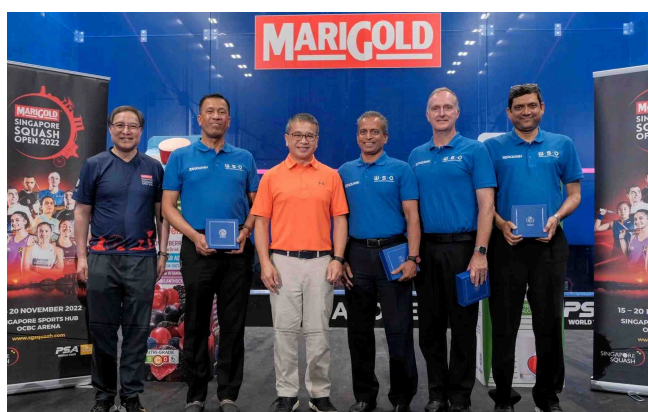
Referees at Singapore Open