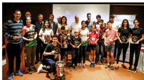
CCI Western India Slam