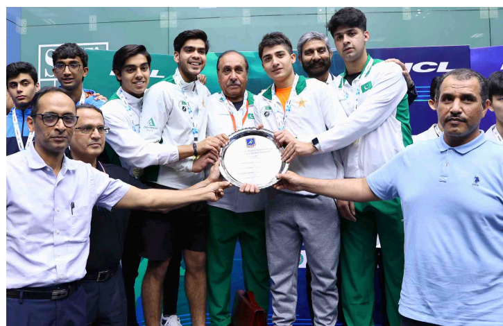
Guests present the ASF Championship Trophy to 2023 Asian Junior Men's Team Champion - Pakistan