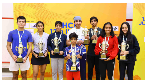
HCL Indian Junior Open