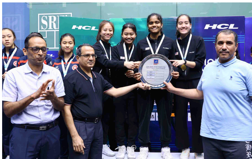
Guests present the ASF Championship Trophy to 2023 Asian Junior Women's Team Champion - Malaysia