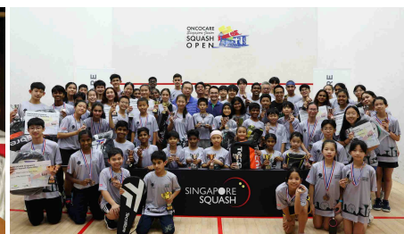
ONCOCARE Singapore Junior Open