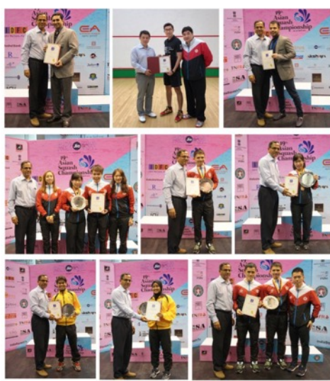
The Prize Presentation at the 2017 Asian Individual Championships in Chennai.

Please visit the <u>ASF official</u> <u>website</u> for the full list of the Awards' Winners.