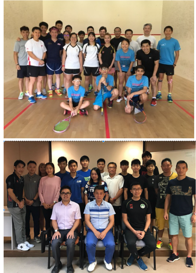
<u>Top</u>: WSF Level 1 Coaching Course in Singapore. <u>Bottom:</u> WSF Level 1 Coaching Course in Macau, China.