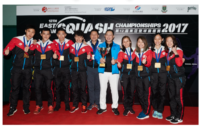
<u>Top</u>: Hong Kong, China Team, the Gold Medallists of the Mixed Team Event.

The East Asian Team Championships 2017 were concluded on 9 July 2017 in Hong Kong, China. We would like to congratulate Hong Kong, China who retains its seventh consecutive Champion title. Applause should also go to all other winning teams. We would also like to express our great gratitude to Hong Kong Squash, who hosted such a successful event.