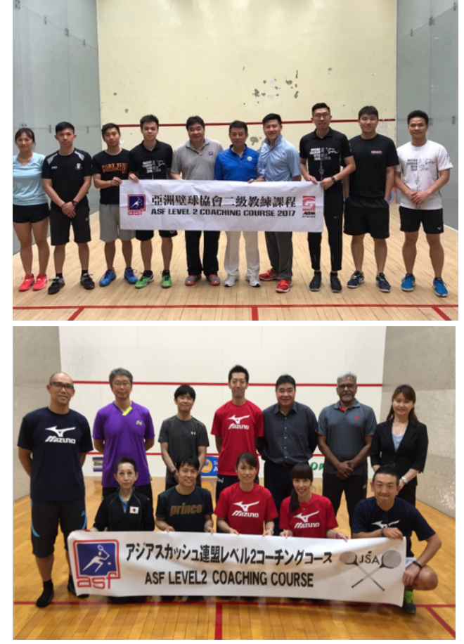
<u>Top:</u> ASF Level 2 Coaching Course in Macau, China. <u>Bottom:</u> ASF Level 2 Coaching Course in Japan.

I am delighted to report that two ASF sanctioned and supported Level 2 Coaching Courses were held in Macau China (April & May), and Japan (June) respectively. This is the first time for the two regions to organise the Level 2 Coaching Course and the feedback were very encouraging. There were also two WSF Level 1 Coaching Courses: one in Singapore (Apr) and one in Macau China (Sept). Besides, India also organised one WSF Level 2 Coaching Course in Chennai in May. I would like to thank the respective associations for their support as well as all the course tutors for their time and dedication.