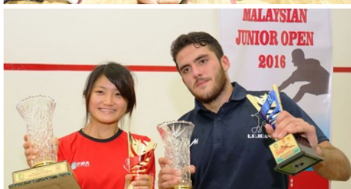
Bottom Right: Penang (Malaysian) Junior Open BU19 & GU19 winners.