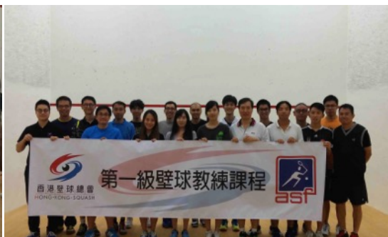
Bottom Left and Right: ASF Level 1 Coaching Course in Hong Kong, China.