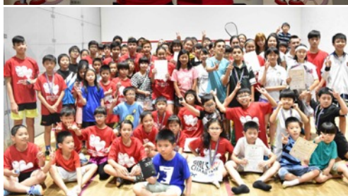
Middle Right: Winners of the Japan Junior Open.