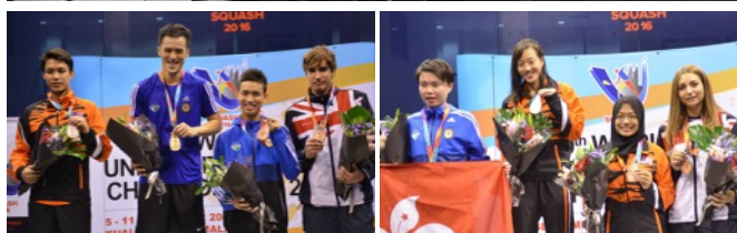
Top: The winning teams of the Mixed Team Event.