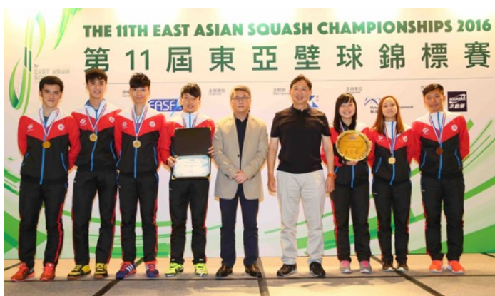
Top: Hong Kong, China Team, the Gold Medallists of the Mixed Team Event.

Gold Medallists - Hong Kong, China Silver Medallists - Japan Bronze Medallists - Korea