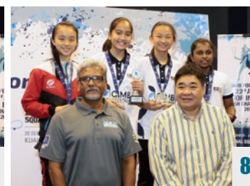
1: Winners of the Boys Under 19. 2: Winners of the Girls Under 19. 3: Winners of the Boys Under 17. 4: Winners of the Girls Under 17.