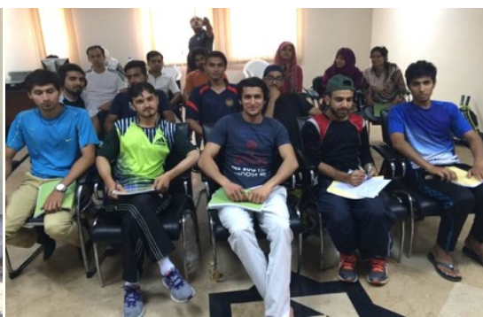
Top Left and Right: ASF Level 1 Coaching Course in Islamabad, Pakistan.