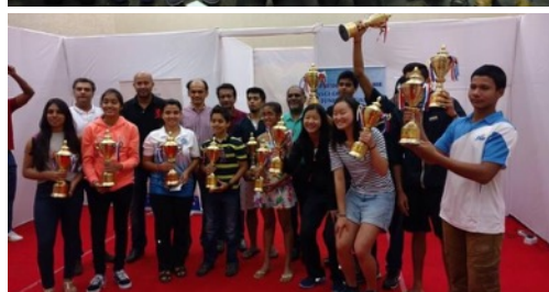
Bottom Left: Winners of NSCI Indian Classic.