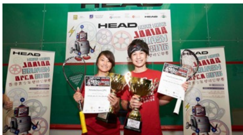
Top Right: HEAD Hong Kong Junior Open BU19 & GU19 winners.