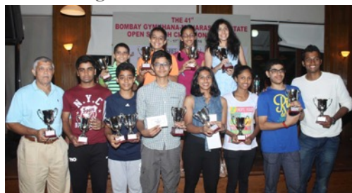
Top Left: Winners of Bombay Gymkhana Maharashtra State Open Junior Tournament.

There were total 7 junior competitions between July and September. They are Bombay Gymkhana Maharashtra State Open Junior Tournament, HEAD Hong Kong Junior Open, Indian Junior Open, Iran Junior Open, Japan Junior Open, NSCI Indian Classic, Penang (Malaysian) Junior Open,. We'd like to congratulate all participants and winners as well as to thank the organisers for making the events all the success!