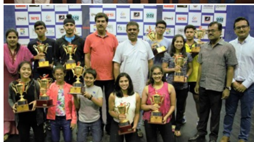
Middle Left: Winners of Indian Junior Open.