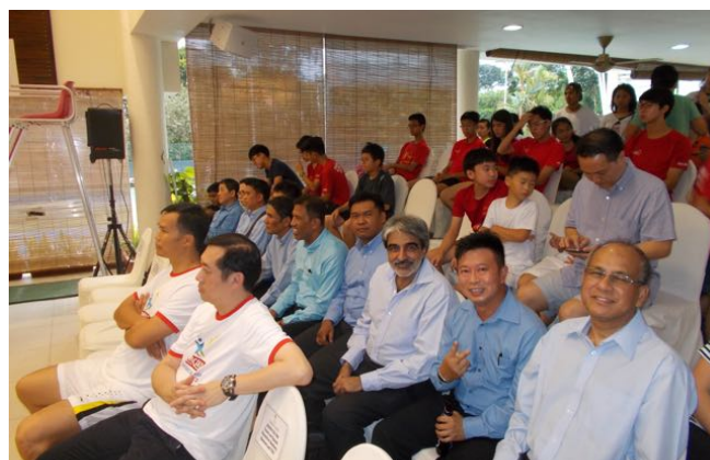
Top Left: The referees in the South East Asia Cup.