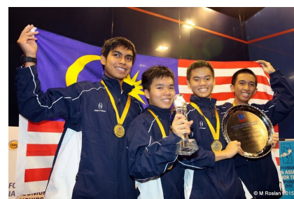
Right: The Malaysian Double Champion Teams: Girls' Team (top) and the Boys' Team (bottom).