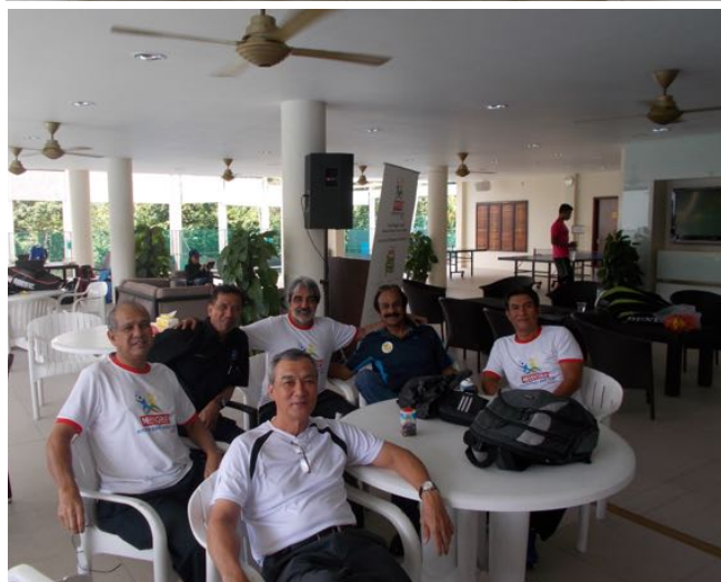
Bottom Left: Referees relaxing in the foyer of the Singapore Island Country Club during the South East Asia Cup.