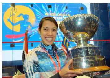
Left: Nicol David (MAS), the eight-time World Champion.