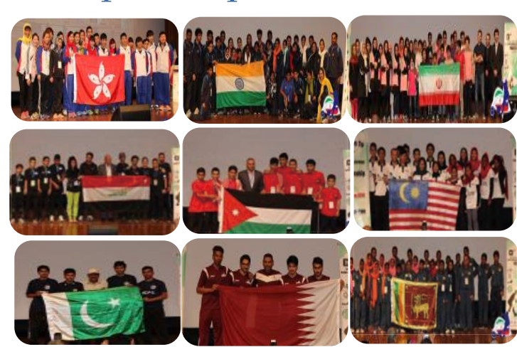
The 9 participating regions for the Asian Junior Individual Championships: