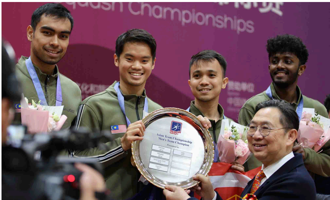
Men's Team Champion.