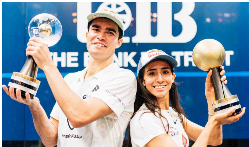
The newly crowned World Men's and Women's Champion: Diego Elias from Peru and Nouran Gohar from Egypt.

PSA World Championships was successfully held in Cairo, Egypt 9 - 18 May 2024. Our congratulations would go to Diego Elias (Peru) and Nouran Gohar (Egypt), who crowned the World Men's and Women's Champion respectively.