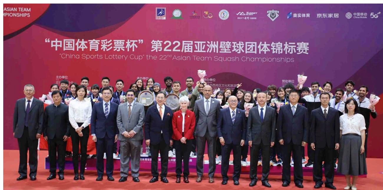
Men's and Women's Team Championships Winners and Guests.