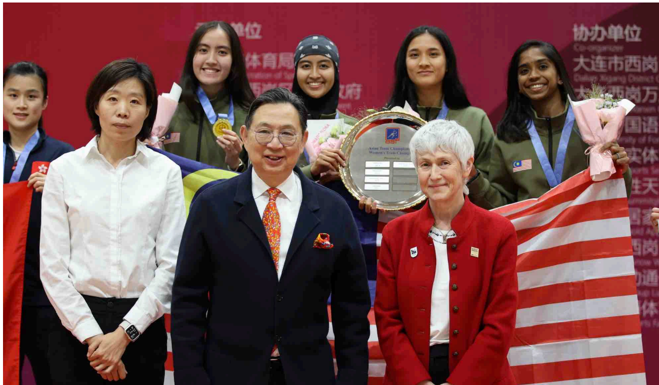
Women's Team Champion.