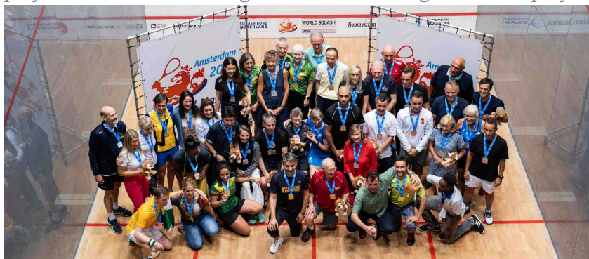
Winners of the WSF World Masters Championships 2024.

WSF World Masters Championships was triumphantly concluded in Amsterdam, Netherlands from 15 - 22 August 2024. The event has smashed previous entry records with a total of 1227 players. Our warmest congratulations would go to all the players and winners.