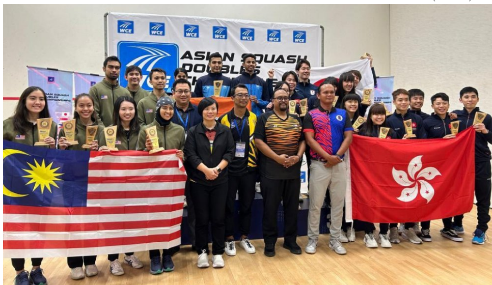
Winners of the Asian Squash Doubles Championships