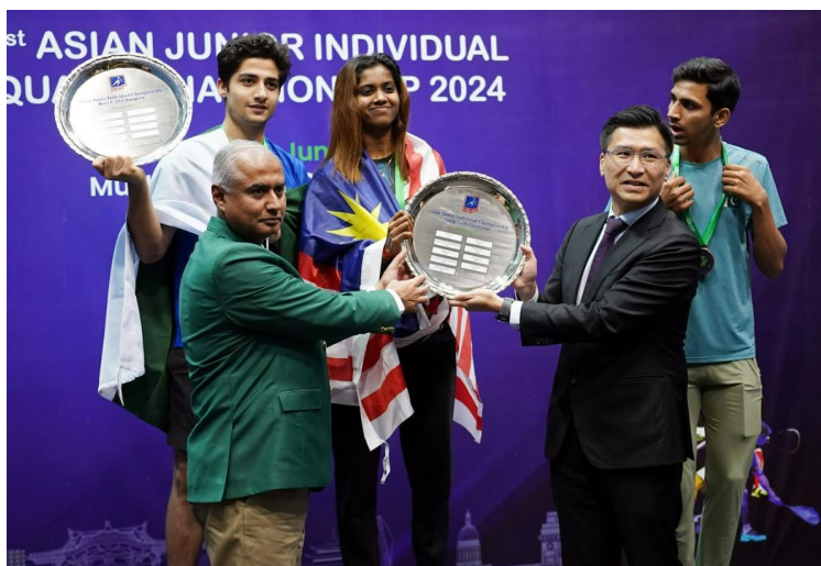
Boys and Girls Under 19 Champion.