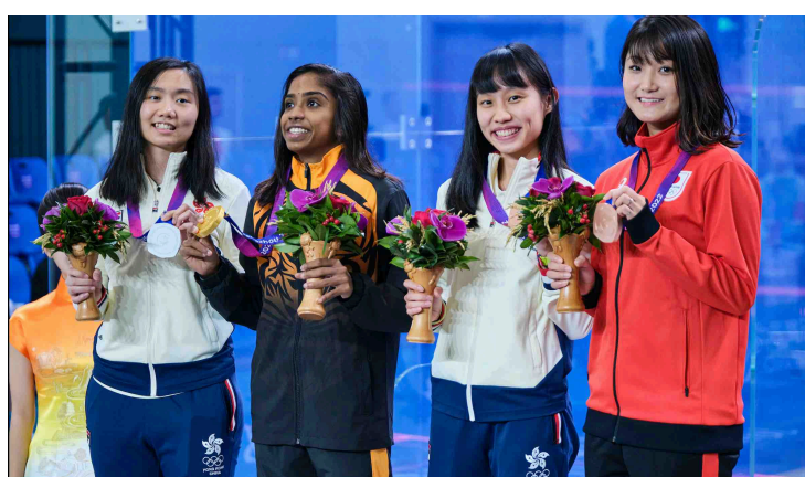
Women's Individual Winners.