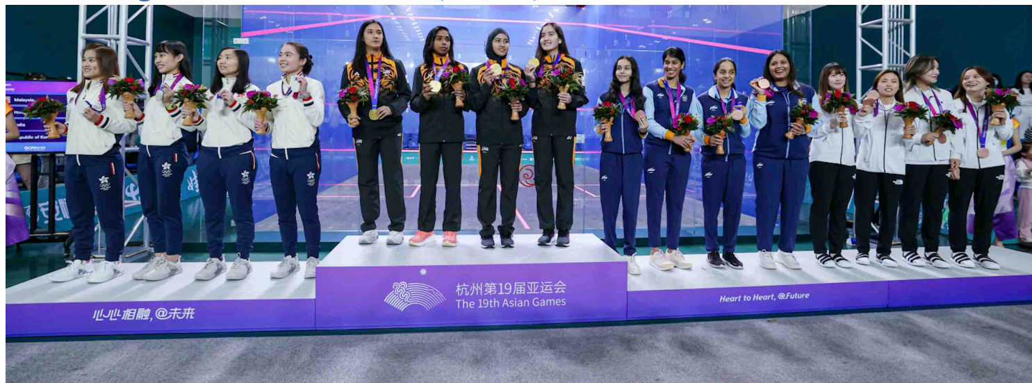
Women's Team Winners.