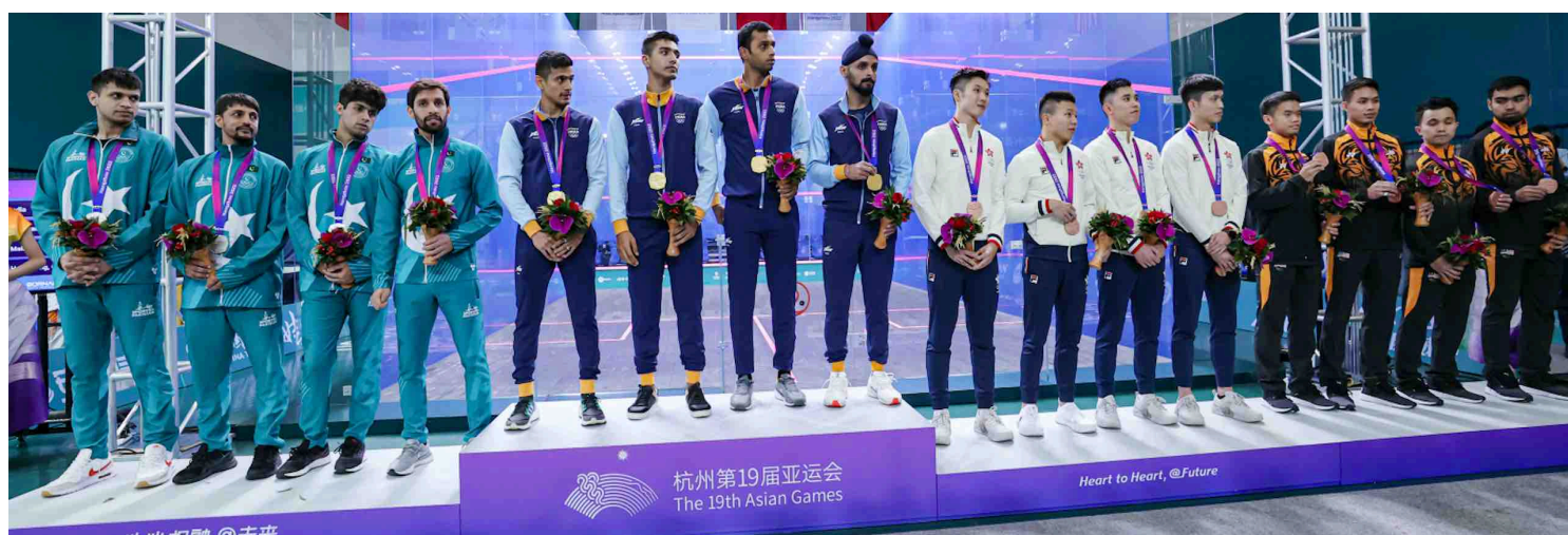
Men's Team Winners.