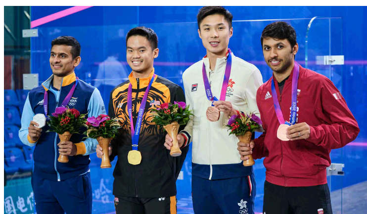
Men's Individual Winners.