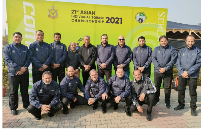
Officials at the 21st Asian Individual Championships.