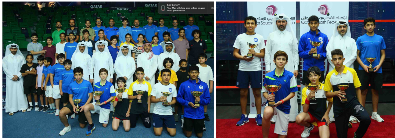
Qatar Junior Open 2021.

Due to the persistent pandemic situation, there was only one junior competition: Qatar Junior Open, which was held 7 - 11 November 2021. We'd like to congratulate all participants and winners as well as to thank Qatar Squash Federation for making the event all the success!