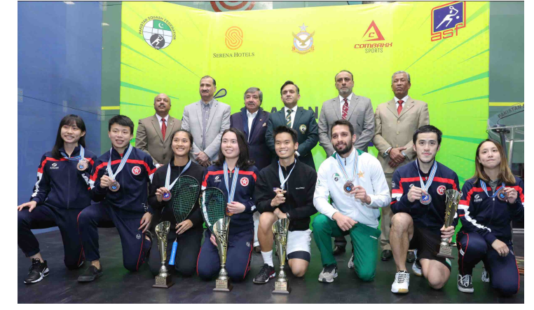
Guests and all winners at the Prize Presentation Ceremony.