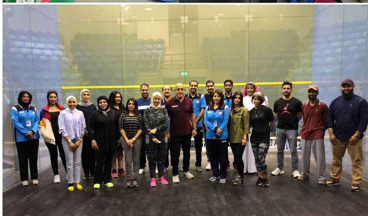
Top Left: Referees - Singapore Masters 2021; Top Right: Referee Clinic along with players on briefing on COVID-19 SOP's Hyderabad in Pakistan; Bottom Left: Referee at Singapore Squash Circuit; Bottom Right: Referees Clinic with Women's Committee in Kuwait.