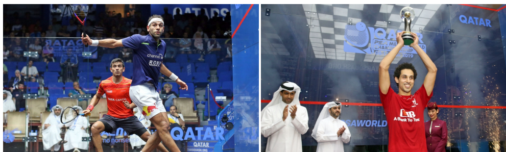
Left: Saurav Ghosal (IND), the one in red top, lost to the 1st seed, Mohamed El Shorbagy (EGY) in the 3rd round. Abdullah Altamimi of Qatar also reached 3rd round and lost to the 2nd seed, Tarek Momen (EGY), the Champion. Right: Tarek Momen (EGY), 2019 Men's World Champion.

PSA Men's World Championships was successfully held on 8 - 15 November 2019 in Doha, Qatar. Hong Kong China, India, Japan, Malaysia, Pakistan and Qatar from Asia participated in the event. We would like to congratulate Qatar Squash Federation on once again hosting a successful world championship.