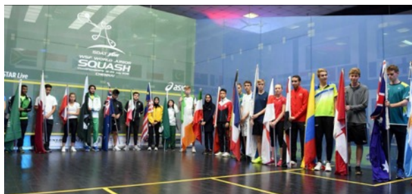
Right: The Opening Ceremony

For the Championships, 9 Asian regions included Hong Kong China, India, Iran, Macau China, Malaysia, Pakistan, Qatar, Singapore and Saudi Arabia, sent teams and players to participate. For the full results, please visit the official website .