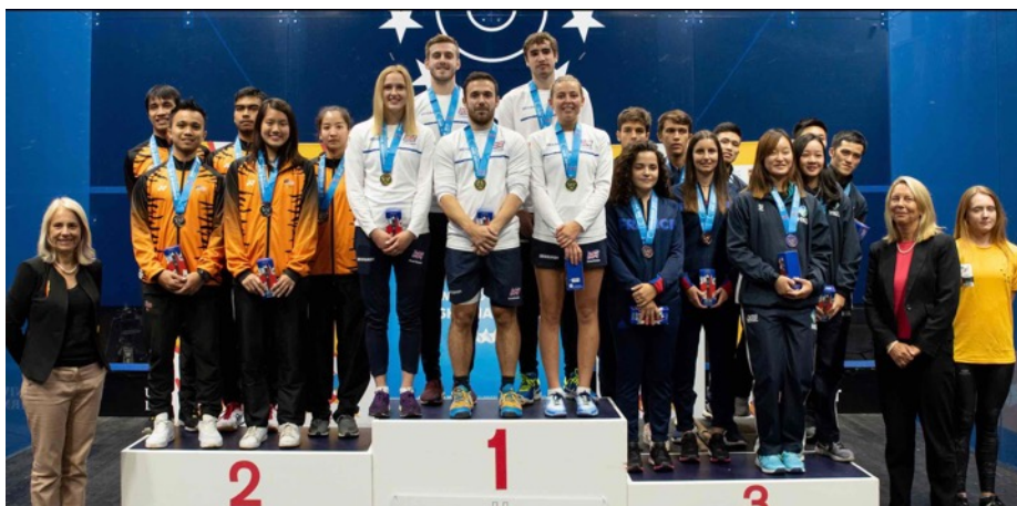
Top: The winning teams: Britain (Gold), Malaysia (Silver), France (Co-Bronze) and Hong Kong China (Co-Bronze)

FISU World University Championship 2018, that was held from 5 to 12 September in Birmingham, England, attracted 9 participating nations from the world. China, Hong Kong China and Malaysia were the only 3 Asian regions to participate. The Asian players once again attained some remarkable results. Malaysia claimed a silver medal in the Team Event and two bronze medals in the Men's and Women's Individual Event respectively. Hong Kong China also claimed a silver medal in the Men's Individual and a bronze in the Team Event. Please refer to FISU World University Championship for the full results.