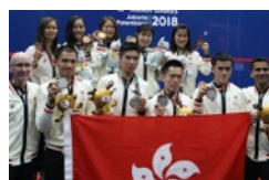
HONG KONG, CHINA TEAMS