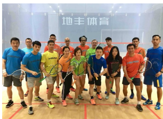
Top: WSF Level 1 Tutor Coaching Course in KL, Malaysia.